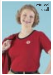
twin set shell