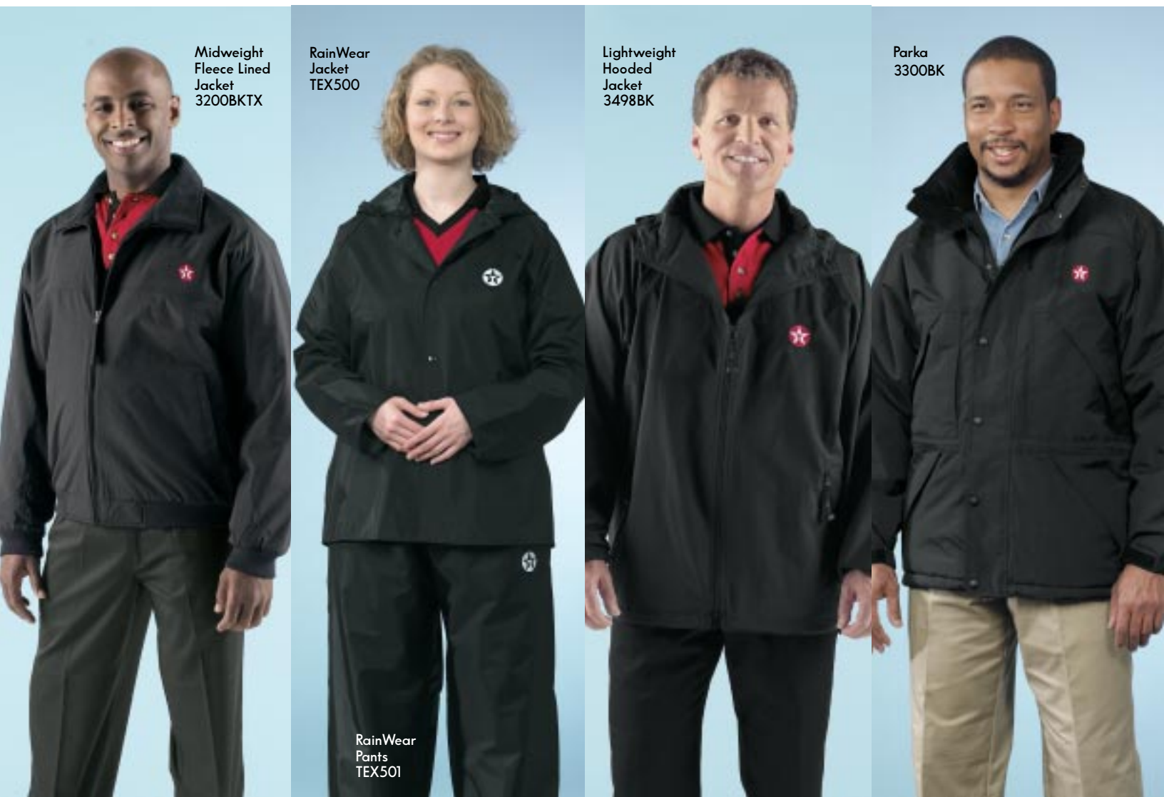
Midweight Fleece Lined Jacket 3200BKTX