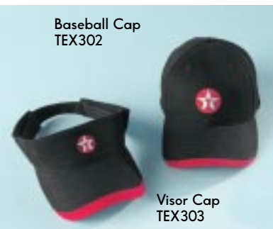
Baseball Cap TEX302