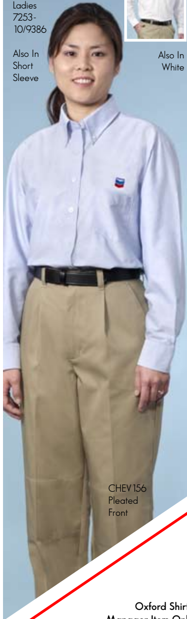
CHEV156 Pleated Front