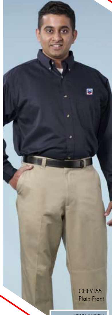
CHEV155 Plain Front