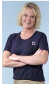
CHEV683 Twin Set

6 oz. Designed exclusively for you! Short sleeve pullover shell with scoop neck and knit trim at waist and matching long sleeve button-up cardigan. Navy pique body with Chevron logo embroidery on left chest of both pieces.