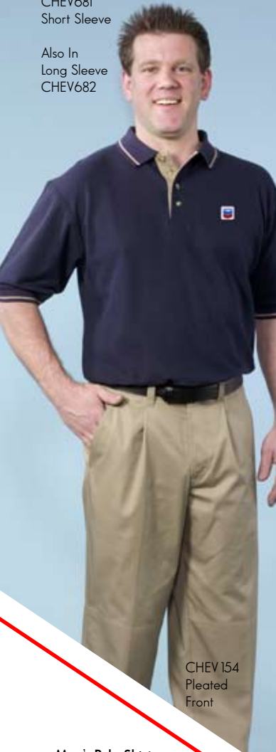
CHEV154 Pleated Front